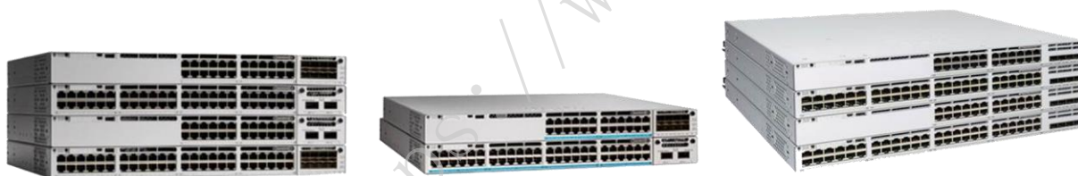
Figure 1. Cisco Catalyst 9300 Series switches

The Cisco Catalyst 9300 Series is made up of nineteen modular uplink switch models and fourteen fixed uplink switch models.