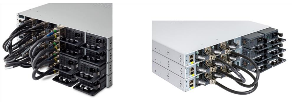
Figure 5. Cisco Catalyst 9300 Series modular uplink models stack (C9300/C9300X SKUs) and fixed uplink models stack (C9300L SKUs)

Cisco Catalyst 9300 Series switch models are designed for stacking switches as a single virtual switch, enabling customers to have a single management plane and control plane for up to 448 access ports.