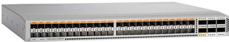
Figure 2. Cisco Nexus 2348UPQ Fabric Extender (Port View)

The Cisco Nexus 2348UPQ fabric extender (Figure 2) is a general-purpose unified port - capable (currently, Fibre Channel functions are supported only in Nexus 5600 since 7.3(0) N1 (1)) 1/10 Gigabit Ethernet fabric extender for workloads such as large-volume databases, distributed storage, and video editing. The Cisco Nexus 2348UPQ supports 48 x 1- and 10-Gbps host unified ports as well as up to six 40-Gbps uplink ports to the parent switch. The 40-Gbps uplinks support BiDi optics for simple connectivity using your existing cable plan. The unified ports provide connectivity to 2-, 4-, 8-, and 16-Gbps Fibre Channel (24 ports for 16 Gbps) as well as 1 and 10 Gigabit Ethernet and FCoE connectivity options (currently, Fibre Channel functions are supported only in hardware). The Cisco Nexus 2348UPQ has a deep 32-MB shared buffer that helps increase performance, and it supports FCoE and Data Center Bridging (DCB) network technologies, which boost the reliability, efficiency, and scalability of Ethernet networks. These features provide support for multiple traffic classes over a lossless Ethernet fabric, enabling consolidation of LAN, SAN, and cluster environments.