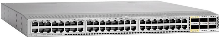
Figure 4. Cisco Nexus 2348TQ Fabric Extender (Port View)

The Nexus 2348TQ (Figure 4) is a low-power platform that is well suited for migration to 10GBASE-T. It supports high-density 100 Megabit Ethernet and 1 and 10 Gigabit Ethernet environments and has 48 x 100MBASE-T and 1/10GBASE-T host interface (HIF) ports as well up to six 40-Gbps uplink ports to the parent switch. The 40-Gbps uplinks support BiDi optics for simple connectivity using your existing cable plan, while lowering power and solution costs. The Cisco Nexus 2348TQ supports FCoE.