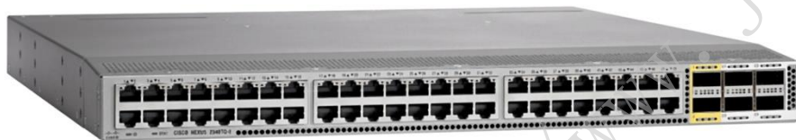
Figure 8. Cisco Nexus 2348TQ-E Fabric Extender (Port View)

The Nexus 2348TQ-E (Figure 4) is a cost optimized platform that is well suited for migration to 10GBASE-T. It supports high-density 100 Megabit Ethernet and 1 and 10 Gigabit Ethernet environments and has 48 x 100MBASE-T and 1/10GBASE-T Host Interface (HIF) ports as well up to six 40-Gbps uplink ports to the parent switch. The 40-Gbps uplinks support BiDi optics for simple connectivity using your existing cable plan, while lowering power and solution costs. The Cisco Nexus 2348TQ-E supports FCoE.