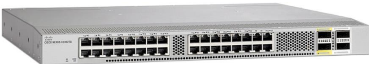
Figure 6. Cisco Nexus 2332TQ Fabric Extender (Port View)

The Cisco Nexus 2332TQ (Figure 6) is a low-port-count, low-power 10GBASE-T platform with 32 100MBASE-T and 1/10GBASE-T HIF ports as well as four 40-Gbps uplink ports to the parent switch. This platform is well suited for customers with lower power requirements and with lower port density in the rack. The 40-Gbps uplinks support BiDi optics for simple connectivity using your existing cable plan, while lowering power and solution costs. The Cisco Nexus 2332TQ supports FCoE.