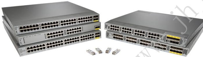
Figure 2. Cisco Nexus 2000 Series Fabric Extenders

The Cisco Nexus 2000 Series Fabric Extenders comprise a category of data center products that provide a server-access platform that scales across a multitude of 1 Gigabit Ethernet, 10 Gigabit Ethernet, unified fabric, rack, and blade server environments. The Cisco Nexus 2000 Series Fabric Extenders are designed to simplify data center architecture and operations by dramatically reducing the points of management and by meeting the business and application needs of a data center. Working in conjunction with Cisco Nexus switches, the Cisco Nexus 2000 Series Fabric Extenders offer a cost-effective and efficient way to support today’s Gigabit Ethernet environments while allowing easy migration to 10 Gigabit Ethernet, virtual machine-aware Cisco unified fabric technologies.