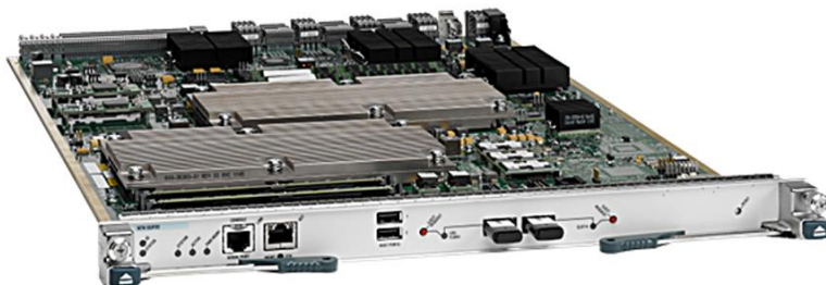
Figure 2. Cisco Nexus 7000 Series Supervisor2 Enhanced Module

The Cisco Nexus 7000 Series Sup2E Module (Figure 2) is based on a two-quad-core Intel Xeon processor with 32 GB of memory that scales the control plane by harnessing the flexibility and power of the two quad cores. With four times the CPU and memory power of the first-generation Cisco Nexus 7000 Series Supervisor1 (Sup1) Module, the Sup2E module offers the highest control-plane performance and scalability of the modules: for example, supporting more VDCs 1 and fabric extenders.