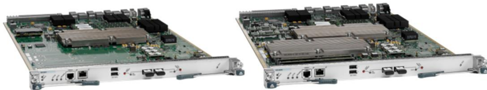
Figure 1. Second-Generation Cisco Nexus 7000 Series Supervisor Modules

The Cisco Nexus 7000 Series Supervisor Modules are designed to deliver scalable control-plane and management functions for the Cisco Nexus 7000 Series chassis. The supervisor controls the Layer 2 and 3 services, redundancy capabilities, configuration management, status monitoring, power and environmental management, and more. It provides centralized arbitration to the system fabric for all line cards. The fully distributed forwarding architecture allows the supervisor to support transparent upgrades to I/O and fabric modules with greater forwarding capacity. Two supervisors are required for a fully redundant system, with one supervisor module running as the active device and the other in hot-standby mode, providing exceptional high-availability features in data center-class products.