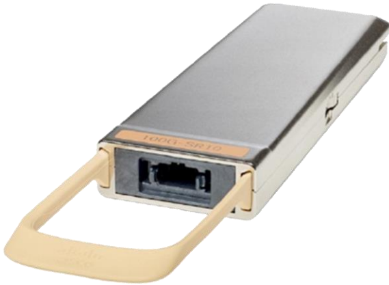
Figure 6. Cisco CPAK-100G-SR10 Module

The Cisco CPAK-100G-SR10 module delivers 100-Gbps links over 24-fiber ribbon cables terminated with MPO/MTP connectors. It can also be used in 10 x 10Gb mode along with ribbon-to-duplex-fiber breakout cables for connectivity to ten 10GBASE-SR optical interfaces. It supports link lengths of 100m and 150m on laser-optimized OM3 and OM4 multifiber cables, respectively.