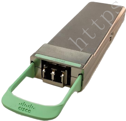
Figure 11. Cisco CPAK-100G-FR Module

The Cisco CPAK-100G-FR Module supports link lengths of up to 2 km over a standard pair of G.652 Single-Mode Fiber (SMF) with duplex LC connectors. The 100 Gigabit Ethernet optical signal is carried over a single wavelength using a PAM4 (Pulse-Amplitude Modulation 4-Level) modulation scheme.