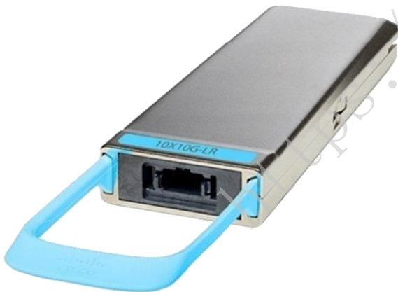
Figure 5. Cisco CPAK-10X10G-LR Module

The Cisco CPAK-10X10G-LR module is used in 10 x 10Gb mode along with ribbon-to-duplex SMF breakout cables for connectivity to ten 10GBASE-LR optical interfaces. It supports link lengths up to 10km over standard SMF, G.652. The module delivers 100-Gbps links over 24-fiber ribbon cables terminated with MPO/MTP connectors.