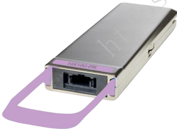
Figure 7. Cisco CPAK-10X10G-ERL Module

The Cisco CPAK-10X10G-ERL module is used in 10 x 10Gb mode along with ribbon-to-duplex SMF breakout cables for connectivity to ten 10GBASE-ER optical interfaces. It supports link lengths up to 25km over standard SMF, G.652. The module delivers 100Gbps links over 24-fiber ribbon cables terminated with MPO/MTP connectors.