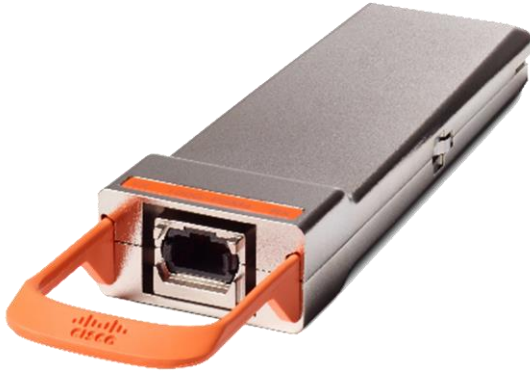
Figure 10. Cisco CPAK-100G-PSM4 Module

The Cisco CPAK-100G-PSM4 Module supports link lengths of up to 500 meters over Single-Mode Fiber (SMF) with MPO connectors. The 100 Gigabit Ethernet signal is carried over 12-fiber parallel fiber terminated with MPO multifiber connectors.