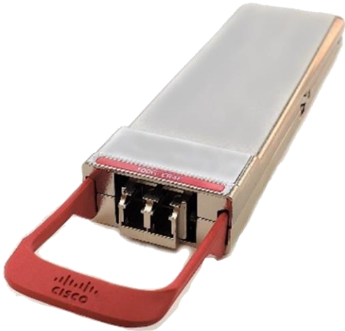
Figure 4. Cisco CPAK-100G-ER4F Module with LC connectors