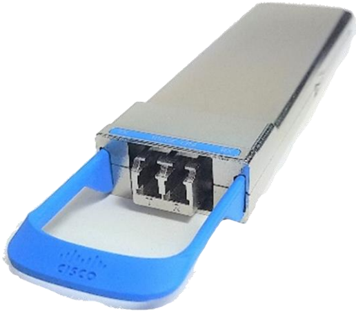
Figure 2. Cisco CPAK-100GE-LR4 Module with LC Connectors