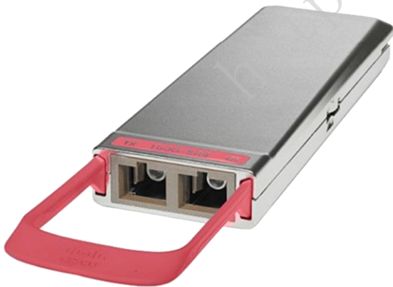
Figure 3. Cisco CPAK-100G-ER4L Module with SC connectors

These ER4 Lite modules are compatible with the 100GBASE-ER4 standard and deliver an aggregate data signal of 100 Gbps, carried over four LAN Wavelength-Division Multiplexing (WDM) wavelengths operating at a nominal 25 Gbps per lane. CPAK-100G-ER4L (no available FEC) supports link lengths up to about 25 km and CPAK-100G-ER4F supports link lengths up to about 30km with FEC disabled and 40km with FEC enabled over standard SMF, G.652. Optical multiplexing and demultiplexing of the four wavelengths are managed within the module.