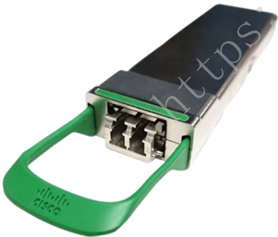
Figure 9. Cisco CPAK-100G-CWDM4 Module

The Cisco CPAK-100G-CWDM4 Module supports link lengths of up to 2 km over a standard pair of G.652 Single-Mode Fiber (SMF) with duplex LC connectors. The 100 Gigabit Ethernet signal is carried over four wavelengths. Multiplexing and demultiplexing of the four wavelengths are managed within the device.