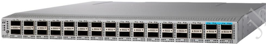
Figure 3. Cisco Nexus 93180LC-EX Switch

The Cisco Nexus 93180LC-EX Switch is the industry's first 50-Gbps-capable 1RU switch that supports 3.6 Tbps of bandwidth and over 2.6 bpps across up to 32 fixed 40- and 50-Gbps QSFP+ ports or up to 18 fixed 100-Gbps ports (Figure 3). The switch can support up to 72 10-Gbps ports using breakout cables. A variety of flexible port configurations are supported using templates.