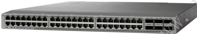
Figure 2. Cisco Nexus 93108TC-FX-24 Switch

The Cisco Nexus 93108TC-FX-24 (Figure 2) is a 1RU switch with 24 10GBASE-T downlink ports (licensed to use any 24 of the 48 ports) that can be configured to work as 100-Mbps, 1-Gbps, or 10-Gbps ports. The 6 uplink ports can be configured as 40- and 100-Gbps ports, offering flexible migration options.