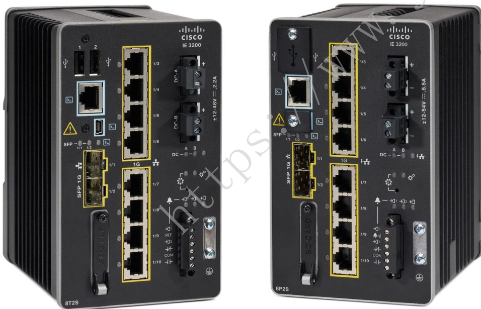
Figure 1. Cisco Catalyst IE3200 Rugged Series

The IE3200 series supports power budget of up to 240W for PoE/PoE+, shared across 8 ports, and is ideal for connecting PoE-powered end devices such as IP cameras, phones, wireless access points, sensors, and more.